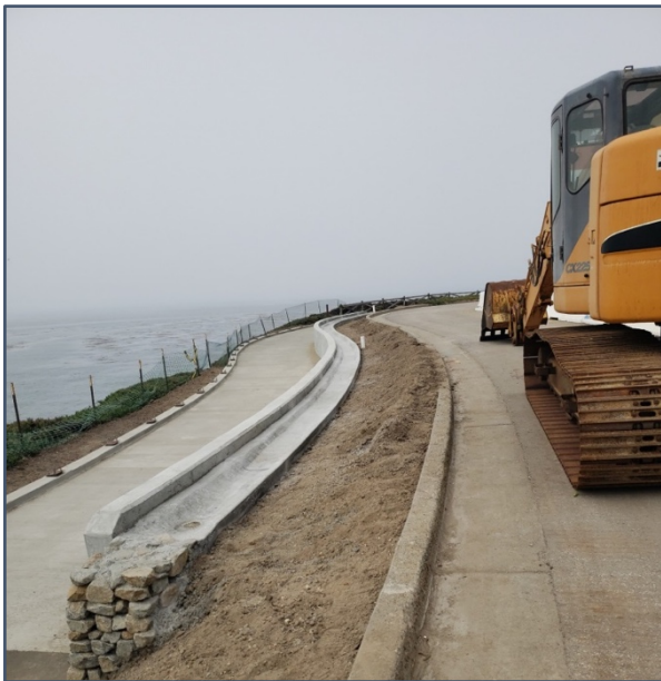
Backfilling and concrete gutter behind the new retaining wall