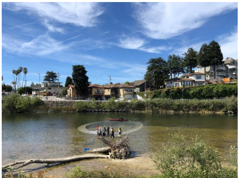
Water Resources staff seining in the San Lorenzo River