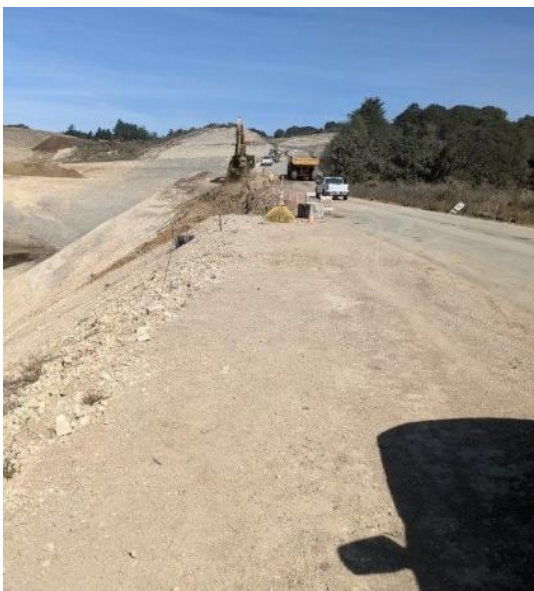
Cell 3B Project

Our collection team responded to a Fire Department request for assistance cleaning up a hydraulic fluid spill that fell off a vehicle. Due to the prompt response from both departments, we were able quickly to prevent the spill from reaching any storm drains, and roadways were reopened for both traffic lanes.