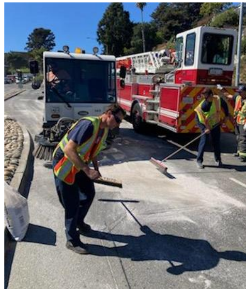
Cross-departmental Clean-up Cooperation