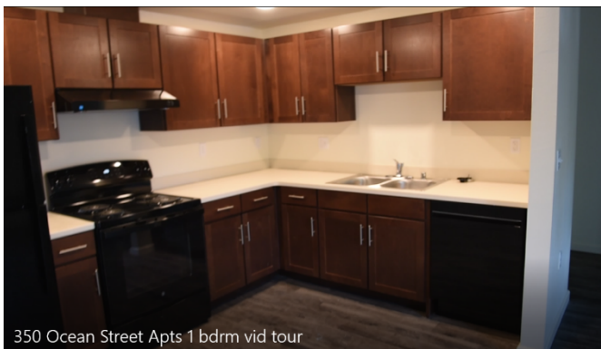
350 Ocean Street Apts 1 bdrm vid tour