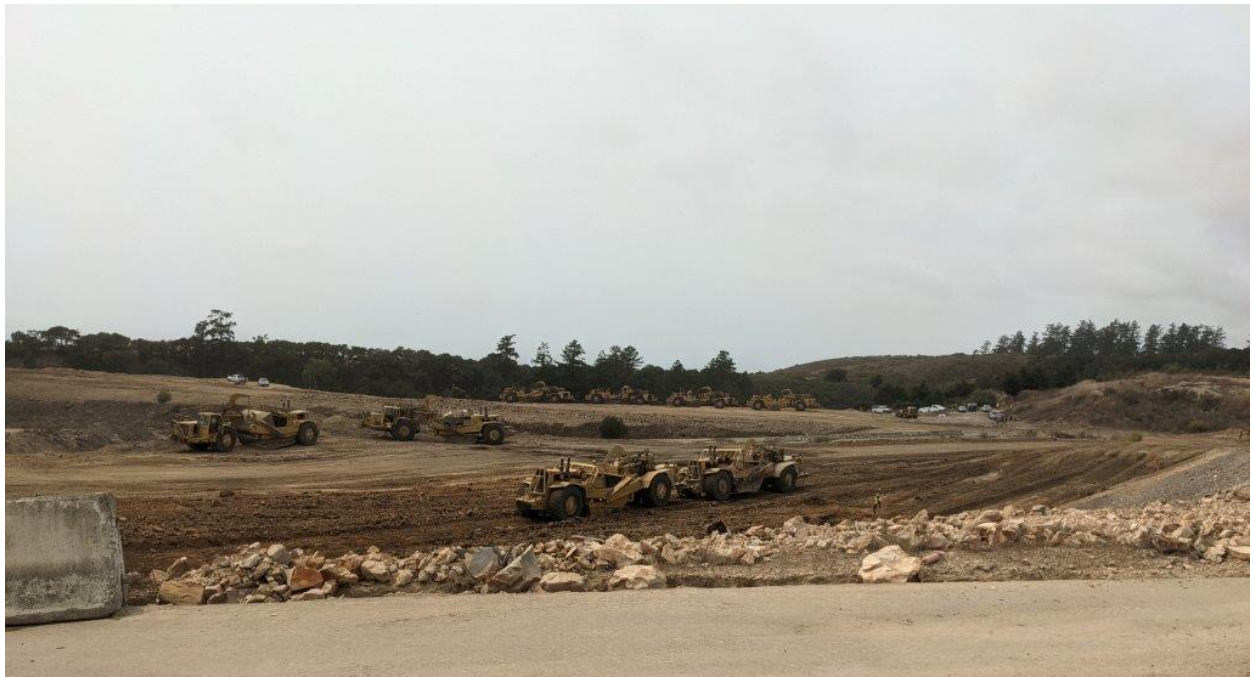
Scrapers hauling material.