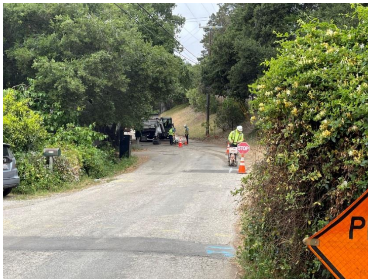
Tight working conditions on Ocean Street Extension

Progress slowly continues on the Ocean Street Extension water main replacement project . We've installed just about 600 lineal feet of 8" pipe so far. The crew has faced alignment issues with the new pipe, as well as tough working conditions due to traffic and reduced work hours. Next week we're hosting an open house for those neighbors, as well as neighbors of the treatment plant, to share detailed construction plans for the new concrete tanks we're building. The tanks project is long and technically challenging, and we want to be as upfront and transparent about what neighbors can expect as we can.