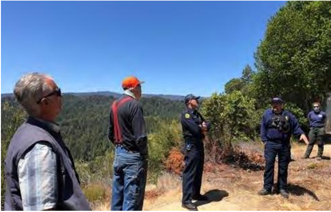
Fire and Water Department staff on a tour of WD properties this week