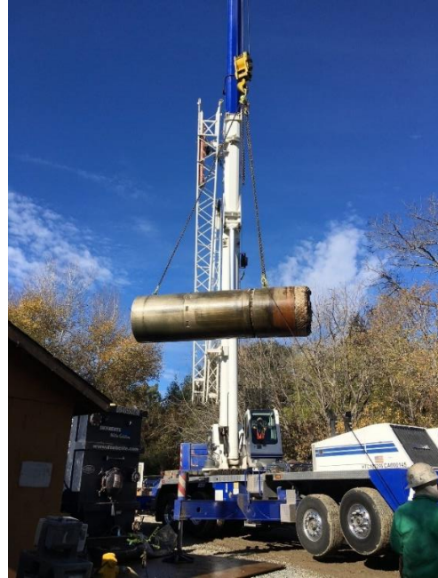
A bit worse for the wear, “after”

In other happenings in the Ocean Street Extension neighborhood, we replaced several 2-inch air vents along the raw water pipeline under OSE this week. Soon we will be replacing several on the treated trunk main as well, in preparation for replacing the critical main that runs under the street. We are grateful to the neighbors who have been patient and supportive of our work – we provide them with transparent weekly updates, preparing them for what they can expect to “see/hear/smell” resulting from our construction work in the following week.