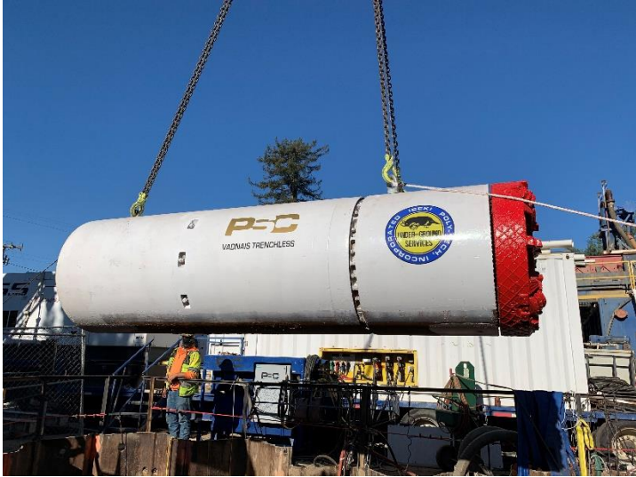
Shiny and clean, “before”