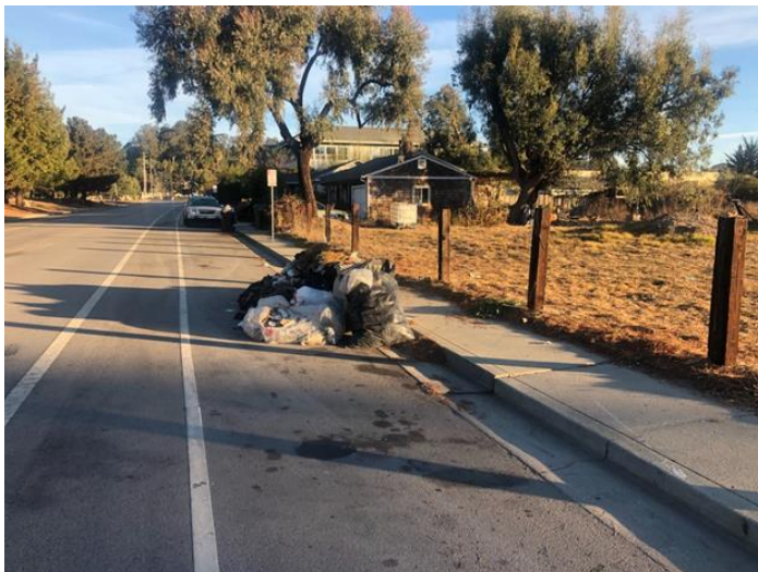
Illegal disposal at 204 Natural Bridges Blvd. Bags

An effort is underway to educate residents on the importance of securing their garbage in designated refuse carts when leaving out at the curb for service. Overloaded garbage carts and extra bags left on the ground attract animals. Torn open bags become a source of litter and have the potential to impact our storm drains during rain events.