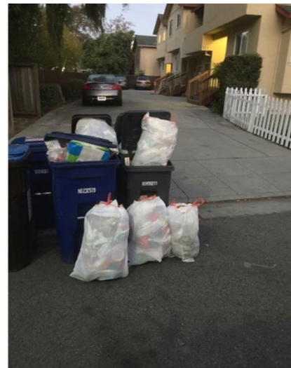
Unsecured Refuse and Recycling