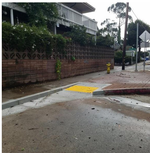
New curb ramp at East Cliff Drive & San Lorenzo River Pathway / New bike ramp at E. Cliff Dr. & Buena Vista

We have completed two of four Street Smarts Pop-Up Bike Light Giveaways in partnership with Bike Santa Cruz County installing nearly 200 front and rear bike lights for Santa Cruz bicyclists in need in the Beach Flats neighborhood and at Delaware/Bethany Curve. As the November days get shorter, these pop-up bike light giveaways are part of the Street Smarts mission to reduce the number of traffic-related crashes and injuries in Santa Cruz. Read more.