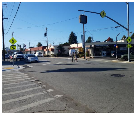
Lt: New rectangular rapid flashing beacon system at East Cliff Drive/San Lorenzo River Pathway (Lt) and Soquel and Mentel avenues (Rt.)