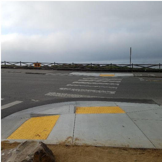
Intersection of West Cliff Drive and Woodrow Avenue Bethany Curve

Construction has started for the HSIP8: Citywide Pedestrian Crossing Improvement Project. We have installed 20 ADA curb ramps along Bethany Curve (between West Cliff Drive and Delaware Avenue) and Soquel Avenue (between Caledonia Street and Seabright Avenue). Construction of new ADA ramps will continue along Soquel Avenue (between Caledonia Street and Seabright Avenue). Construction is anticipated to be complete by December 2020. This project is funded by the Highway Safety Improvement Program Cycle 8 grant.