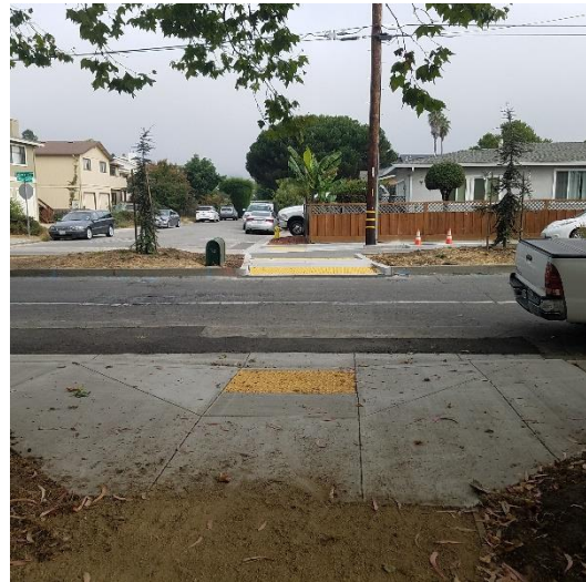
Intersection of Delaware Avenue and Bethany Curve