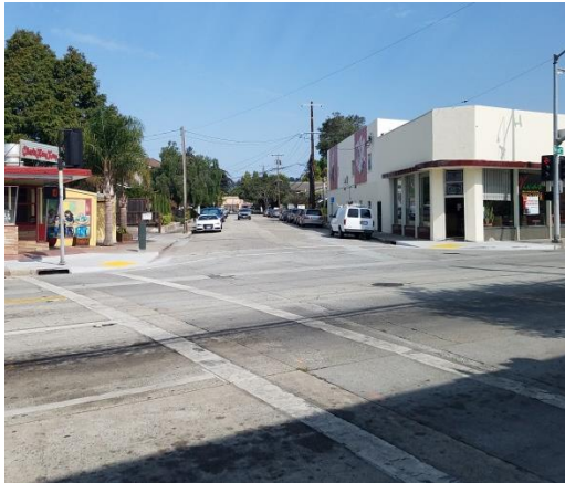
Intersection Soquel/ Seabright

The HSIP8: Citywide Pedestrian Crossing Improvement Project continues. We have installed seven ADA curb ramps along N. Branciforte Ave (between Sunnyside and Keystone) and Soquel Ave. (at Seabright). Construction of new ADA ramps will continue along Soquel (between Caledonia and Seabright) and Ocean Street (at Dakota). Construction should be completed by December with funding by the Highway Safety Improvement Program Cycle 8 grant.