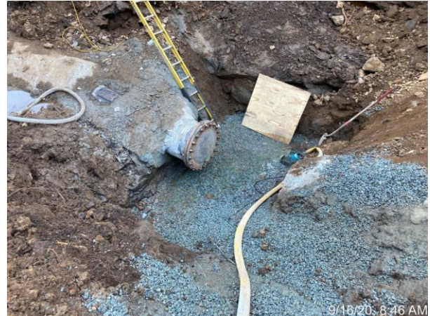
Tie in at toe of the dam

Work to replace the flocculators continues, with the first basin nearing completion. Flocculation is an important initial treatment step as it removes small and microscopic particles.