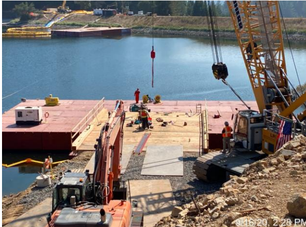
Construction barge on Loch Lomond

After several days' stoppage due to the CZU fire, work is back underway on the Newell Creek Dam inlet/outlet pipeline. About 2,000 feet of new pipeline at the toe of Newell Creek Dam was tied-into the system this week.