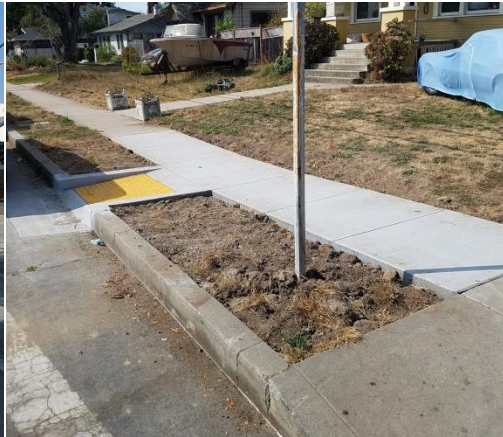
Intersection N. Branciforte/Keystone Ave.

Rail Trail Segment 7 Phase 1 has made progress with Palm Street, Younglove to Rankin, and Rankin/Seaside Intersection now paved. More smooth wire trail fence was also installed between Dufour Street and Almar Avenue. On Fair Ave, curb ramps and lighting foundations were constructed. Concrete lagging for the Almar retaining wall arrived. The wall is expected to take 3-4 weeks to complete.