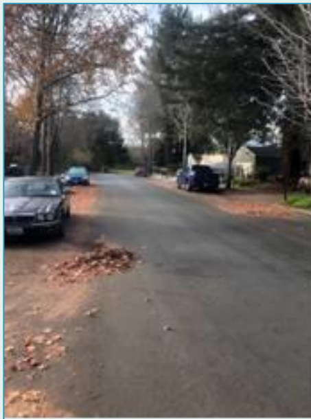
Lee Street Before