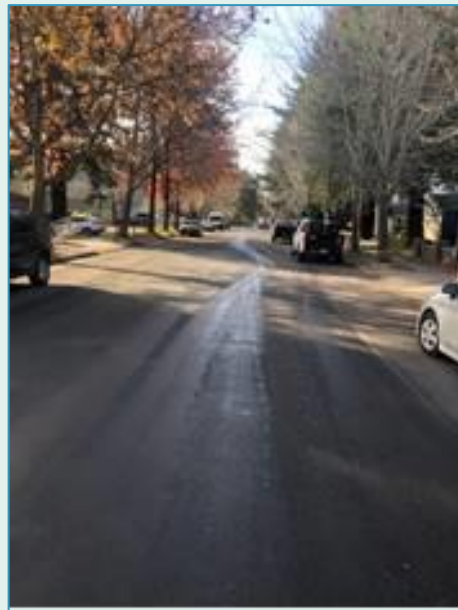
Lee Street After