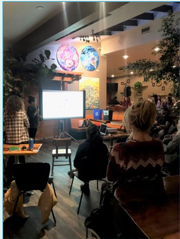
11th Hour Coffee House