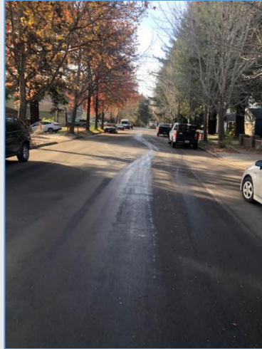
Lee Street Special Sweep and Clean-up

The Resource Recovery Division just completed an agreement with Grey Bears of Santa Cruz County to help fund their polystyrene recycling program. Grey Bears has the only permitted polystyrene recycling machine in the Monterey Bay area and allows City residents to drop-off material at their site. The new agreement allows the City to collect material at the Dimeo Lane facility and transport it to Grey Bears for processing.