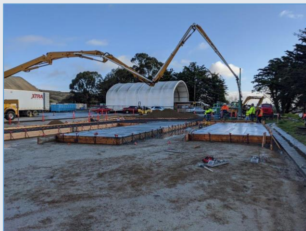
Food Waste Processing System Concrete Pour

Concrete work is being completed this week for the Food Waste Processing System Concrete Pads Project at the Resource Recovery Facility on Dimeo Lane.