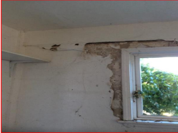
Water leaking due to weather proofing