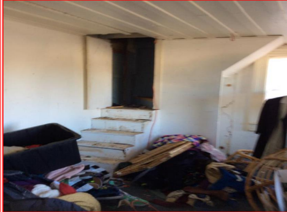
Unable to walk in the living area due to items