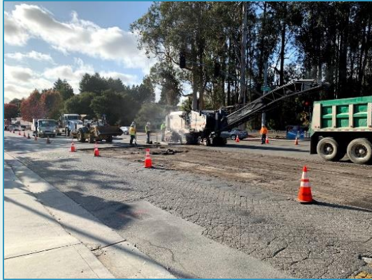
Soquel at La Fonda