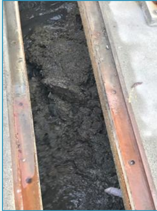
Accumulated grease in the pre-aeration grit system bypass channel during the Effluent Pump Test.