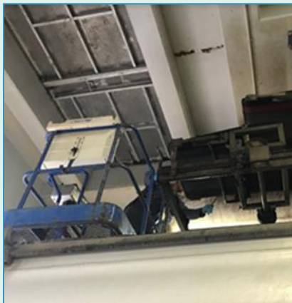
Mechanic making an adjustment to the solids dewatering biosolids trolley conveyor.