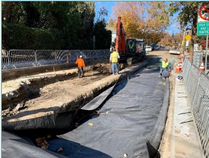
California at Laurel St

At California, the project continued fixing existing sinking pavement close to the intersection with Laurel. The project is funded by Measure D and Measure H tax dollars.