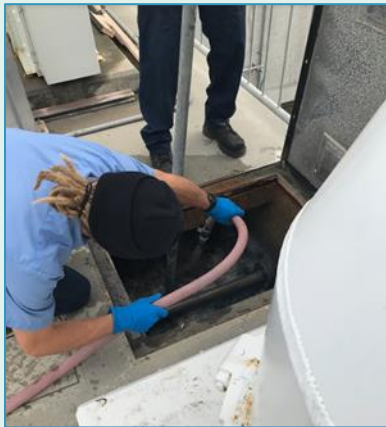
Mechanic making an adjustment to the solids grit system bypass channel.