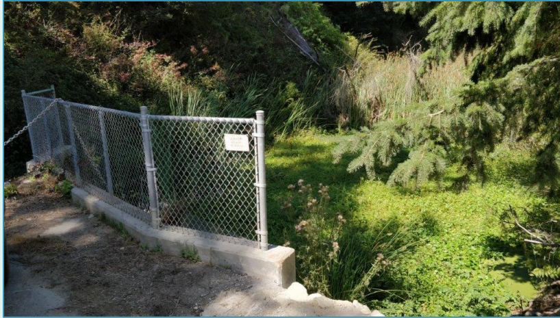
North Pond- Before