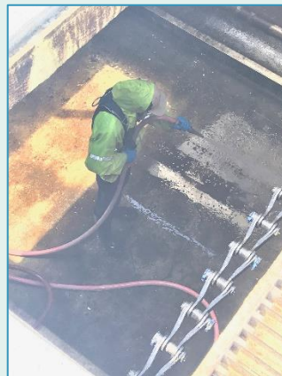
Primary Sedimentation Basins cleaning