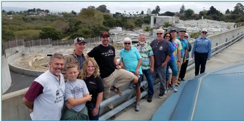
Humphrey Construction tour cleaning

Operators have been in and out of various Primary Sedimentation Basins, performing initial cleaning tasks ahead of mechanical inspections. The collections line maintenance crew tested out a different type of vacuum truck that is used to clean the sanitation sewer system. A contracted tree service company has begun the laborious work of clearing a 10-foot perimeter along the facility's fence line to improve facility security and mitigate fire risks with the vegetation removal.