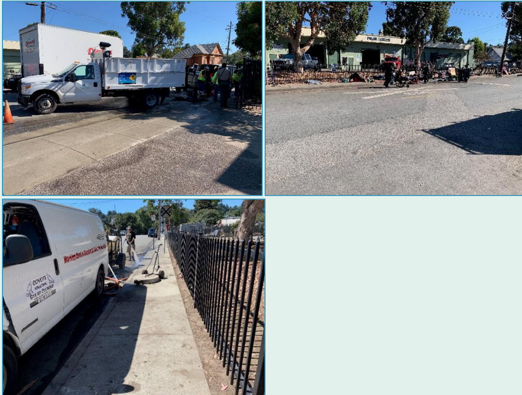
Coral Street sidewalk, gutters and storm drain clean-up

struggles and agreed to jointly put efforts towards cleaning up the area. This cleaning, which is scheduled every other week, along with the new sharps kiosk is aimed to protect the storm drains and decrease the impact of the high population of homeless people on Coral Street.