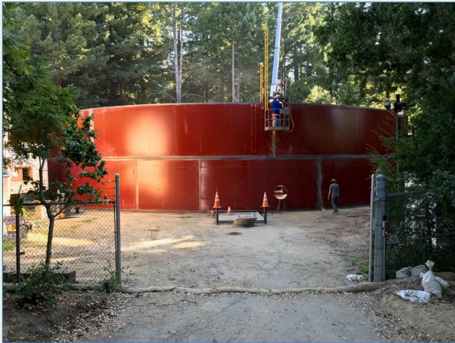
New U-5 water tank