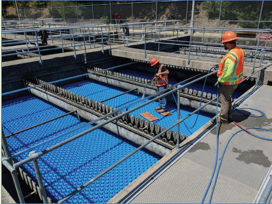
New tube settlers