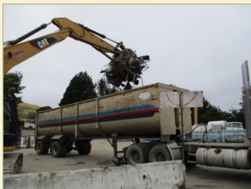
Scrap Metal Processing

A & S Metals arrived on site to begin hauling away 500 to 600 tons of Scrap Metal for recycling. Although market conditions are not good, we continue to move baled Mixed Paper which is currently going to Korea. Instead of shipping out our previous average of 2 loads of paper each week, we now must stockpile four or five loads before shipping.