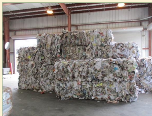
Baled Mixed Paper