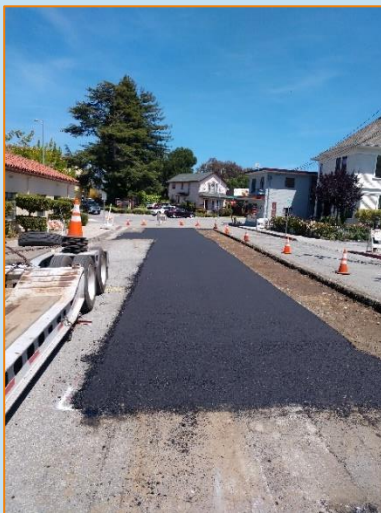
Ocean View Av

We have begun work on the 2019 Surface Seal Project which is repairing various street locations in east and west Santa Cruz. The project is scheduled to continue weekdays through July 31 and is funded by Measure D and Measure H tax dollars. Details including timeline are available at www.cityofsantacruz.com – Your tax dollars at work!