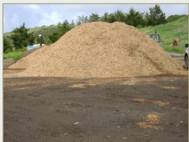
Processed organic materials

Our contracted processor finished the monthly grinding this week. Processed redwood and clean lumber were made into wood chip for resale. Our processed green waste will be used for composting and erosion control, and our processed construction debris for landfill cover material. These numbers are about average for us this year.