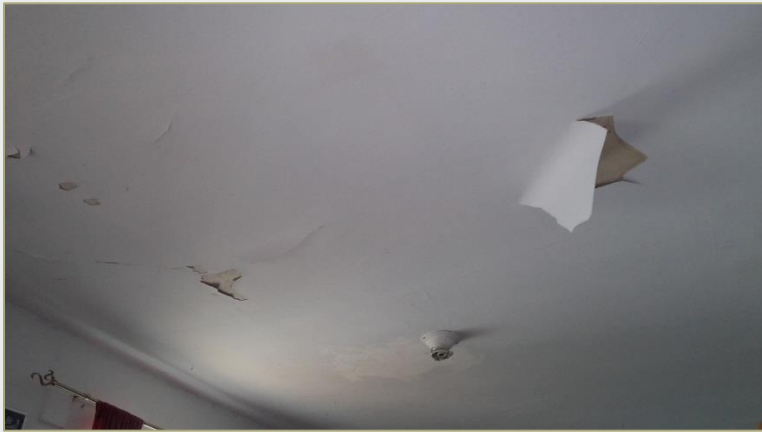
Water intrusion in this bedroom area has caused drywall in the ceiling to sag and peel

In our final news for this week, the Code Compliance Division has four proactive Community Clean-Ups each year, two in Lower Ocean and two in Beach Flats. Code organizes and coordinates the events with other City Departments like Parks and Recreation and Public Works, as well as non-profit organizations such as Grey Bears. Our division coordinates with community members to get the word out and encourage participation. The communities look forward to these events, as we provide dumpsters for tossing and recycling their unwanted items, provide direct contact with public employees who answer Code and Rental related questions, and give updates on items that may affect their neighborhood. It's always a great community-building event! See the flyers below for more information.