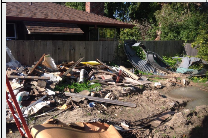
Rear yard before