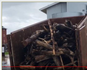
Beach Driftwood for art project

Did you know that there are two basic rules for recycling plastic bags and plastic wrap here in Santa Cruz? Click our video link on the left for details.