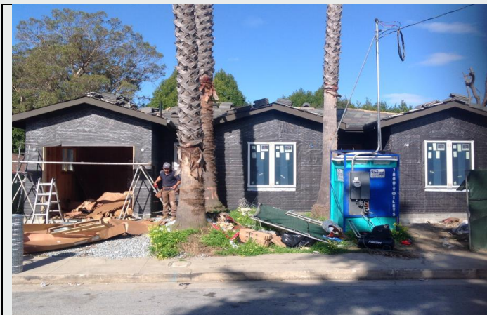
Front yard before

Through the Community Request for Service Portal (CRSP) the Code Division responded to an active building site where the unsecured temporary fence had failed which exposed the site. The exposed work site is an attractive nuisance for homeless and children that contained materials such as nails, screws, lumber, piping, bottles and cans. The rear yard of the work site had become a dump site for surplus construction materials and trash and debris. Through a coordinated effort by the Code Compliance and Building & Safety Divisions, the site was cleaned up.