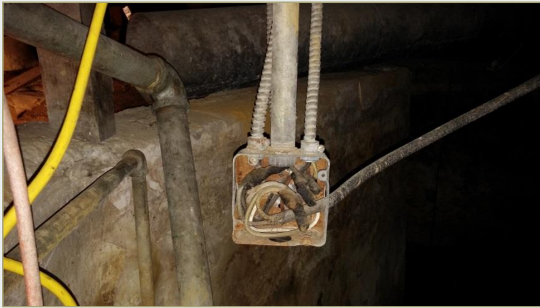
Exposed wires in this J-Box pose an electrical shock hazard

Here are some other examples of safety, health, and living conditions that the Code and Rental inspectors helped to improve in the past couple of weeks: