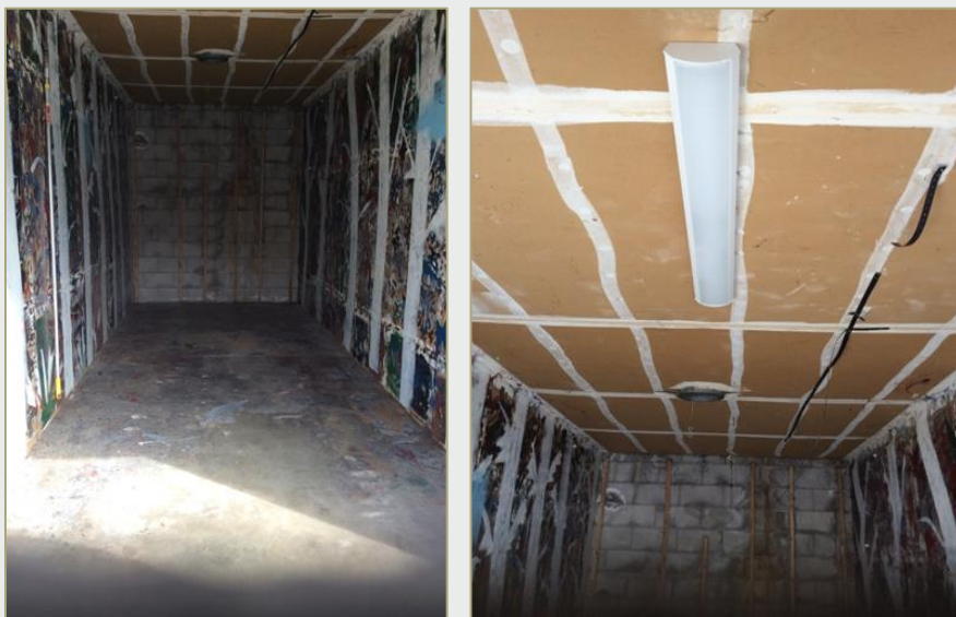
Storage unit after eviction