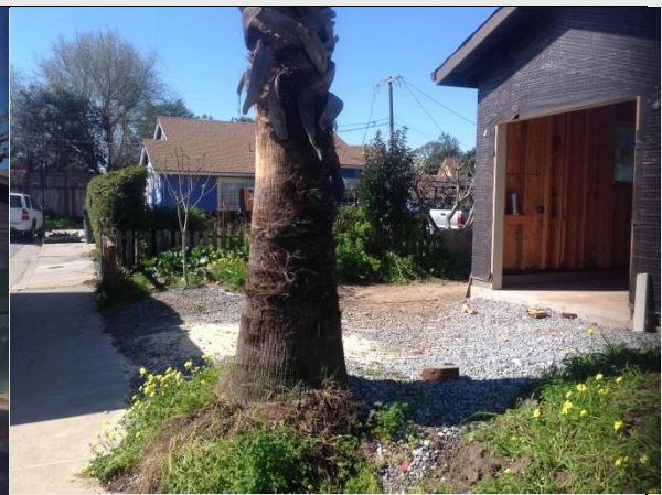
Front yard after