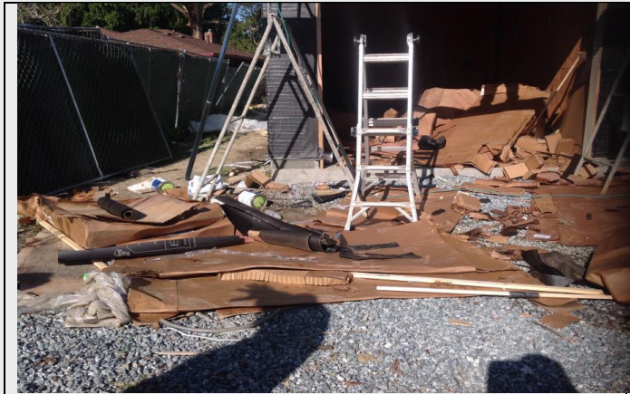
Side yard before