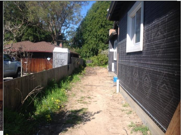
Side yard after