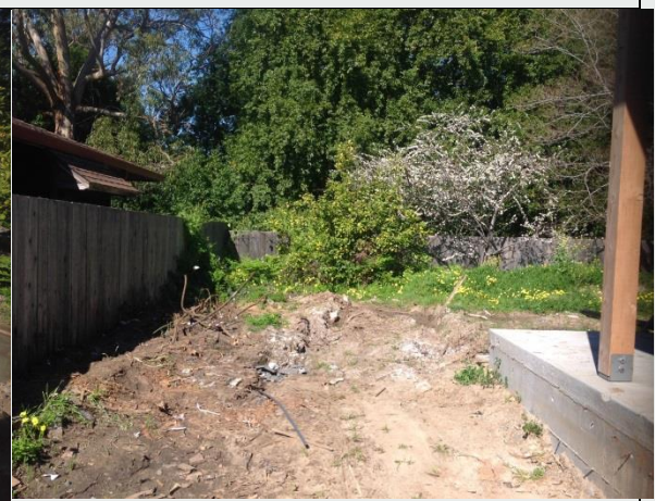
Rear yard after

Our team received a report that a broken planter box was hanging over the public right of way, which was a potential falling hazard that could injure pedestrians. After contacting the property owner to inform him of the conditions of the planter box, the planter box was removed within hours.