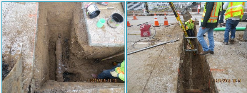
SS lateral replacement at 412 Cedar St.

The Cedar Street Rehabilitation Project continues with the replacement of sanitary sewer laterals along Cedar from Elm to Maple. Weekday traffic impacts continue on Cedar from 7 a.m. to 5 p.m. The project, funded by Measure H tax dollars and a Community Development Block Grant is reconstructing Cedar Street from Church to Laurel and is expected to conclude in early 2019.