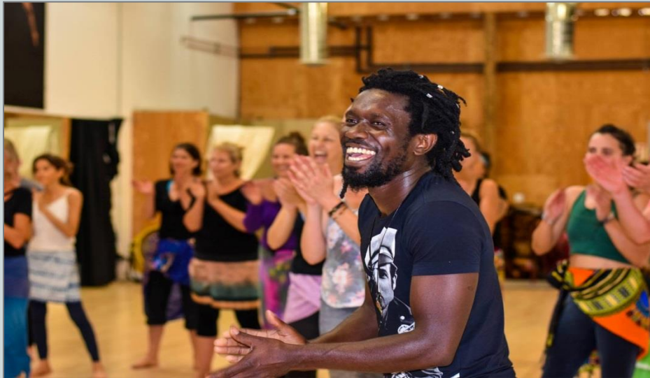
Features the African Diaspora Project

Tannery World Dance + Cultural Center's 2018 World Arts Festival