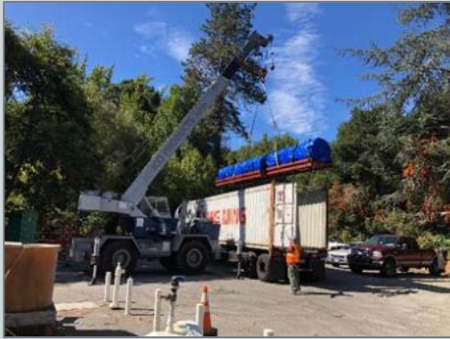
Delivery of the new dam