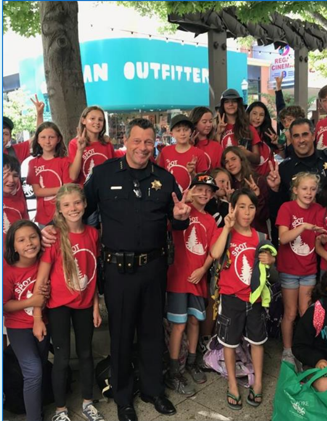
Louden Nelson Community Center