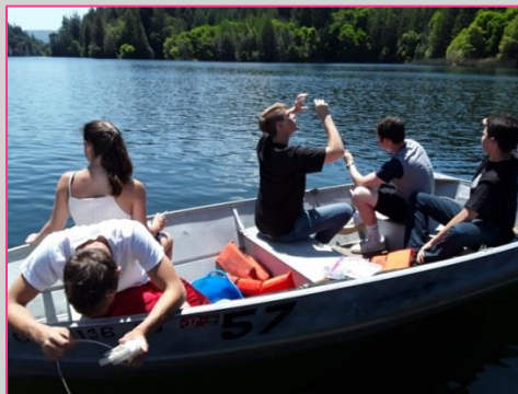
(Students in the Watershed Academy)

As the school year wraps up, we have been super busy with our education programs, forging full speed ahead with our San Lorenzo Valley High School "Watershed Academy" program, while also transitioning Live Oak School District elementary schools into our program for the first time.