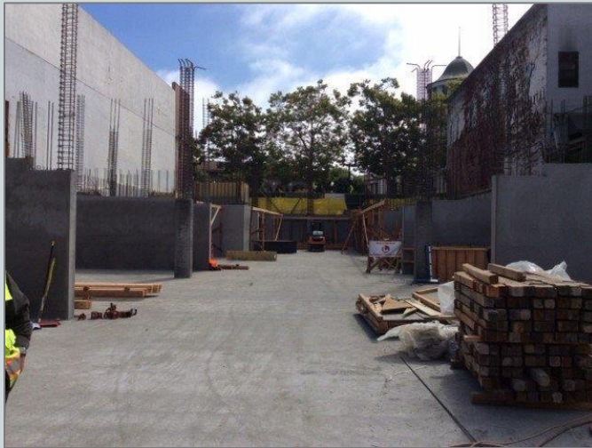
Photo 1: Mat slab for underground parking level and support walls.

The construction of the Park Pacific development at 1547 Pacific Avenue (between Lulu Carpenters and Bank of the West) is progressing at a rapid pace. The mat slab is completed and the foundation walls for the underground parking should be finished within a week. The developer, Swenson, has started shoring for the retail/street level deck on the Pacific Avenue side of the project. The project will have underground parking, 79 residential units, and approximately 6,000 square feet of commercial space. The photos show progress in sequential order as the project work moves up.