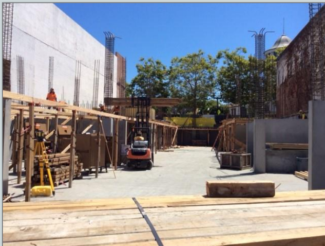
Photo 2: Support framing for foundation walls for street level deck.