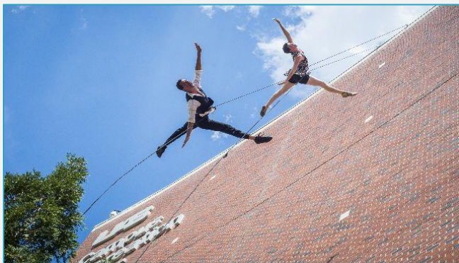
Vertical dance artists Bandaloop will perform.

Artmaking, food trucks, and performances featuring world-renowned vertical performance pioneers BANDALOOP . A pioneer in vertical performance, BANDALOOP seamlessly weaves dynamic physicality, intricate choreography and climbing technology to turn the dance floor on its side.