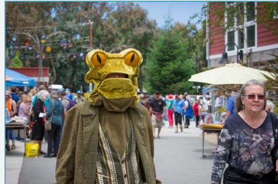
Mr. Frog will return to the Tannery.

Learn more about the festival at www.EbbandFlowFest.org and learn more about River Motion, the digital art display on the Soquel Bridge, here: www.RiverMotionSC.com