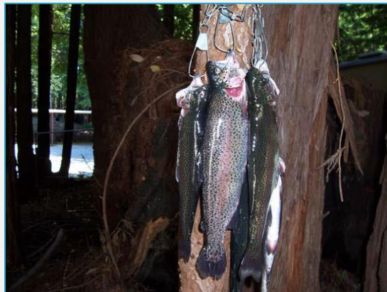
Fruits of Trout Plant Pasts...

While projects are always exciting, the real excitement this week happened at Loch Lomond, with the annual trout plant. Two thousand pounds of young trout were "planted" into the lake, just in time for fishing season and Father's Day. Loch Lomond is always a popular spot for dads and kids to spend some hang time fishing together.