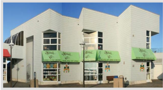
Marini's on the Wharf