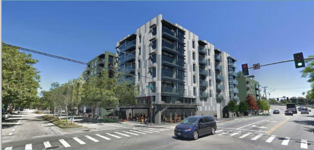
VIEW FROM PACIFIC AND LAUREL