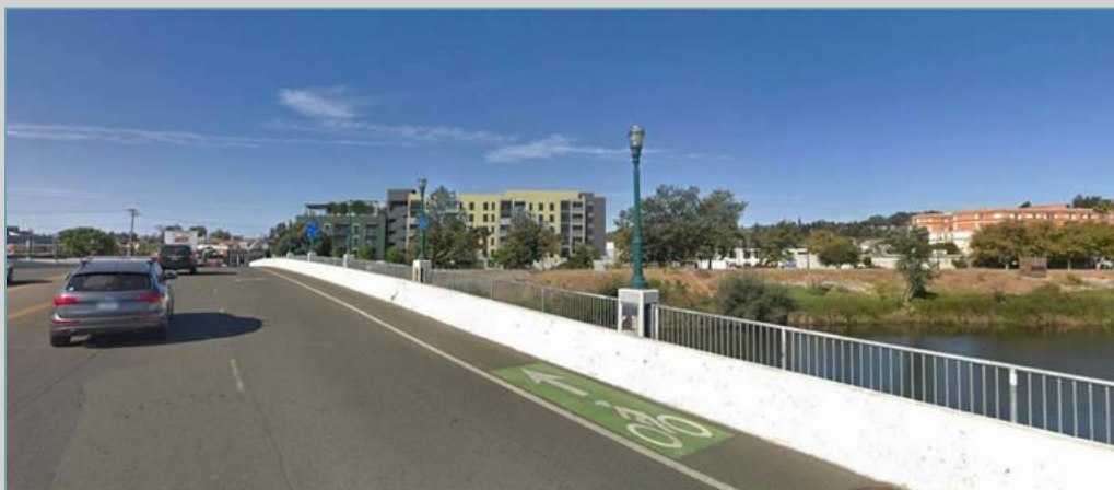
VIEW FROM LAUREL ST BRIDGE