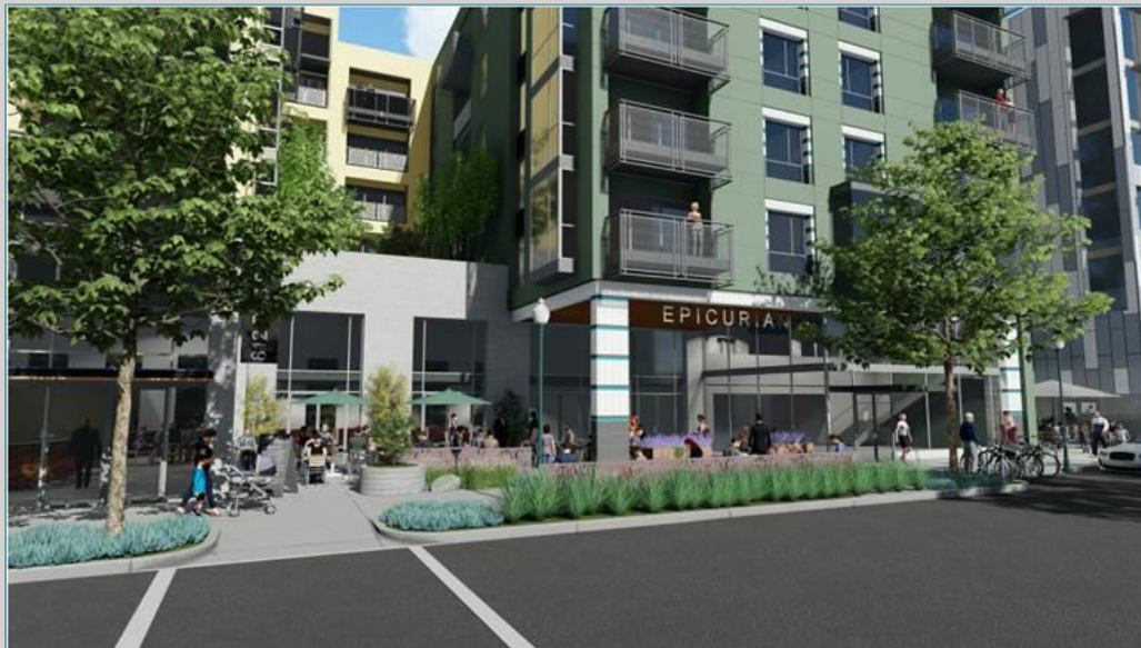
VIEW FROM ACROSS PACIFIC AVENUE