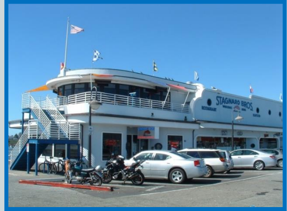
Stagnaro Bros. Restaurant 59 Municipal Wharf, Santa Cruz