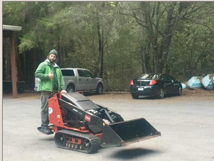
The new Dingo

In preparation for storms that we hope won't be as destructive as last year, Loch Lomond staff has been continuing their fuels reduction work, which includes lots of wood hauling and chipping. We are continuing to clear trees that could come down on trails and roads during storms. We've had no major slides so far, but are ready to combat what winter brings with our new DINGO! The Dingo is a "fun-size" walk/ride behind machine with four attachments: a backhoe, a bucket, a claw and a leveler. We were trained on how to use it this week and are ready to clear any slides, root balls, rocks or whatever a storm brings us.