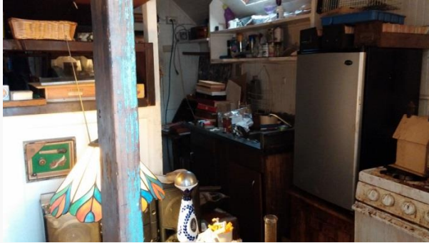
Stove not functioning; exit pathways not clear; toilet also malfunctioning in this unit

Relocation packets have been provided to the tenants and the information has been conveyed to the property owner. The owner is required to provide relocation assistance to the tenants. Select pictures are shown below.