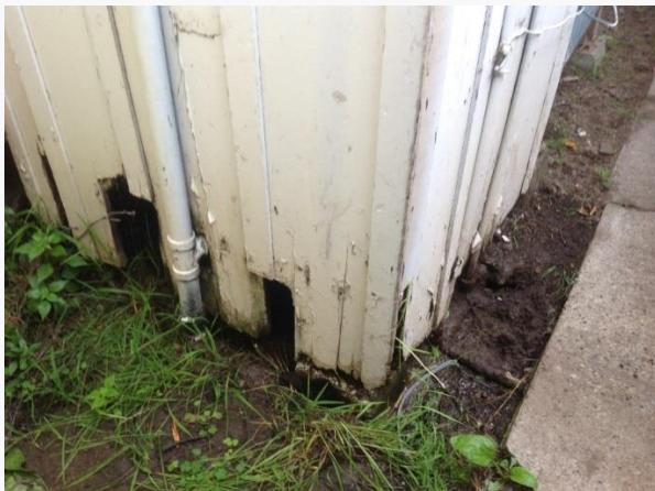
Toilet/sink/shower discharge (blackwater) leaking out into common areas.