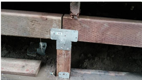
Unpermitted and insufficient structural support posts not on foundation; insufficient rotting support beams at risk of failure