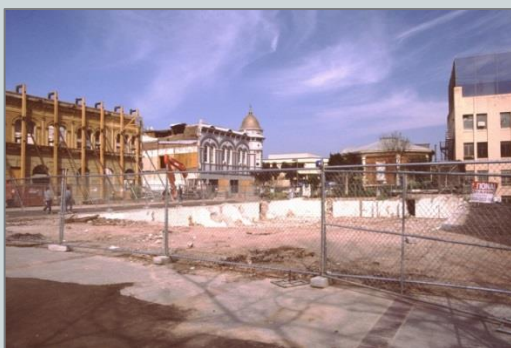
March 1990 View from Pacific near Cooper Street

On October 12 th , the Planning Commission reviewed the Downtown Recovery Plan Amendments and the related Environmental Impact Report (EIR) and voted 5-0 to recommend that the City Council approve the project and certify the EIR. Eight people spoke at the public hearing with five speakers in strong support. The new development standards are examples of regulatory modifications to directly support opportunities to increase housing in the City, which has been the focus of Council discussions for the past several months. The plan amendments reflect Smart Growth and Sustainable Community principles that are key values to the City. The plan further reflects the successful recovery from the 1989 Loma Prieta earthquake and provides a forward-looking vision for lower Pacific Avenue and Front Street portions of downtown. The Downtown Plan and EIR are tentatively scheduled for Council review on November 14 th .