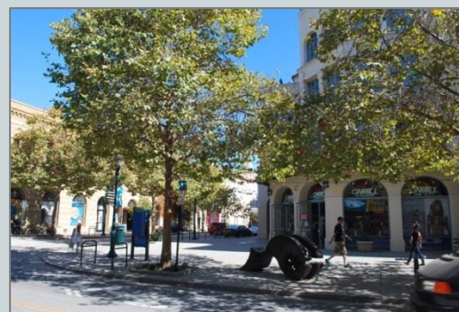
October 2017 present view