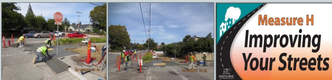
Directional curb ramp at northeast corner of King Street and Laurent Street

2017 Overlay Project work completed this week consisted of removing existing non-ADA complaint curb ramps and installing ADA compliant curb ramps along King Street from Bay Street to Mission Street.