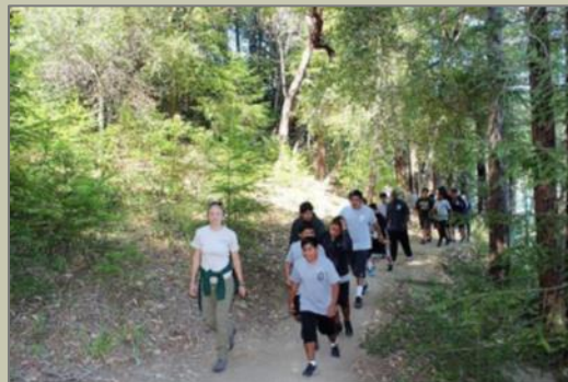
Interpretive hike in Loch Lomond

Loch Lomond Recreation Area staff recently partnered with PD to take twenty at-risk youth on an interpretive hike through the park, followed by a paddle-boat excursion on the lake. Empirical research demonstrates the impact that nature can have on behavior; by all (anecdotal) accounts, the Loch Lomond field trip with PD was a success.