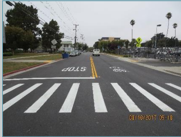
Mission St. Extension