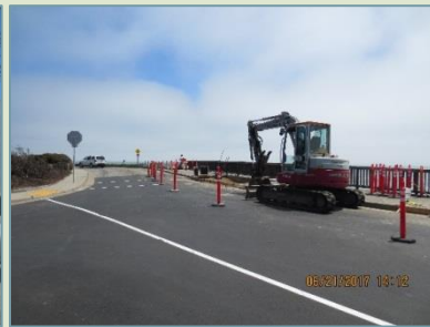
West Cliff Dr. and Swanton Blvd.