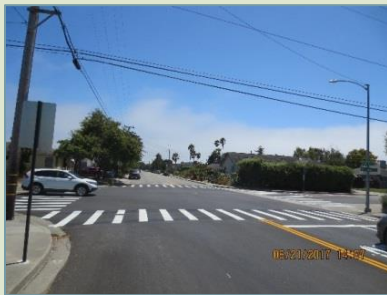
Fair Ave. and Delaware Av.

Drive. Also, concrete work continued at Swanton Boulevard and West Cliff Drive with removal and replacement of two non-ADA compliant curb ramps.