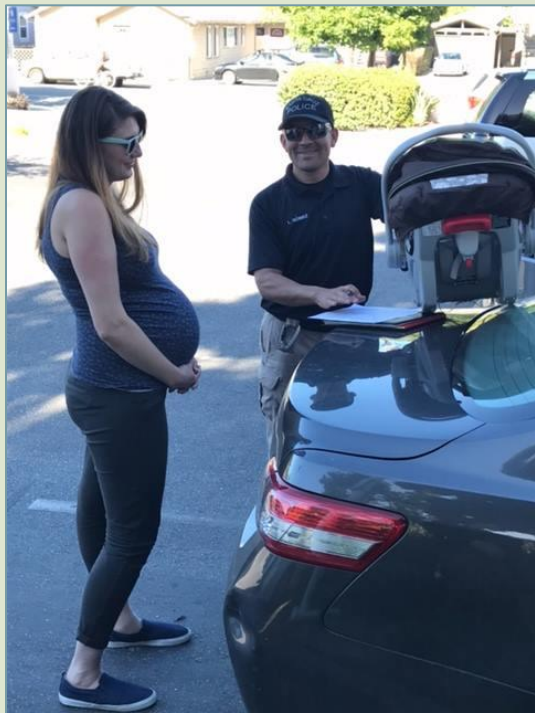
Pictured New Mom-To-Be Gets Help With Car Seat