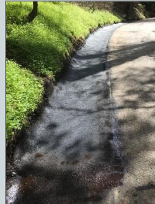
Brookwood valley gutter after paving