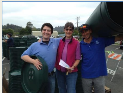
(2014 record-breaking rain barrel event)

Speaking of water conservation, our first "Rain barrel Rodeo" will be held tomorrow morning at our corporation yard. (You may recall that we have a program with a vendor to provide our customers rain barrels at a deeply discounted price.) Times have certainly changed since our rodeos in 2014 and 2015 during the height of our drought; at the first rain barrel event in 2014 we sold 1,500 rain barrels. At our first event tomorrow we will sell 78. We will hold two more rain barrel sales this winter.