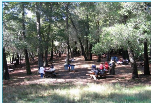
(Students enjoying their picnic lunches after the ranger program)

Lastly at Loch Lomond this week, we wrapped up our watershed education field trips with Santa Cruz City Schools. After students are prepared through watershed education in their classrooms, they're taken first to Henry Cowell to participate in water quality testing, and then on to Loch Lomond for a ranger-led program. These fieldtrips are always popular with students, teachers and parents.