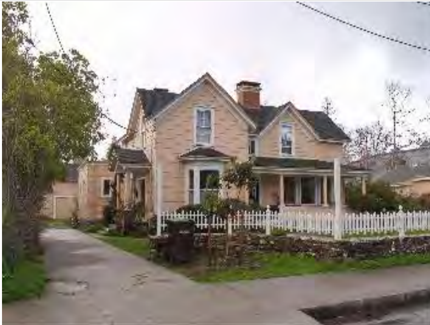
P5b. Description of Photo: (View, date, accession #) View facing south, 2009.

*P4. Resources Present: Building Structure Object Site District Element of District Other (Isolates, etc.)