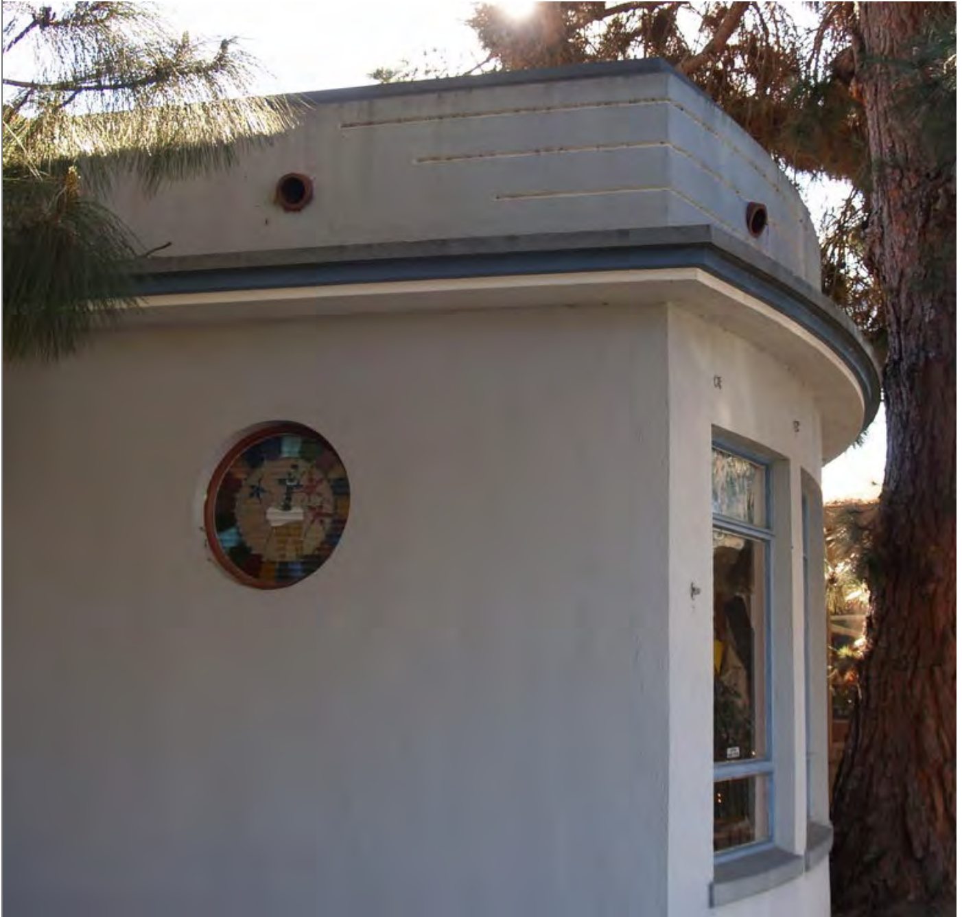
Detail view of front wing, viewed facing south.